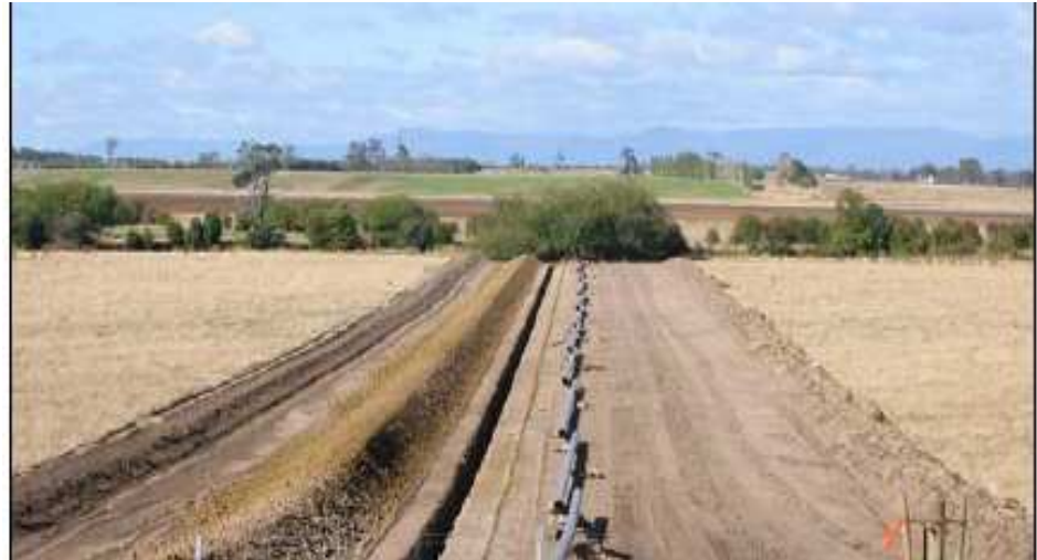
Typical construction corridor layout.